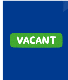
Vacant District 3 Commander Area 1 Summit & Wasatch Counties