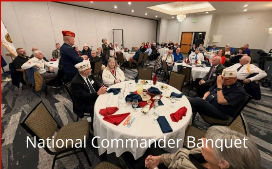
National Commander Banquet