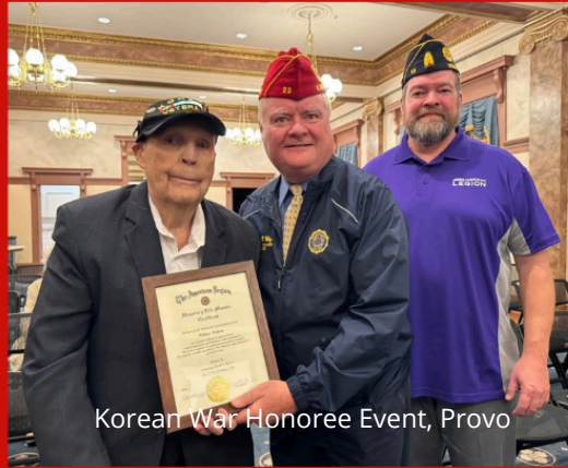
Korean War Honoree Event, Provo