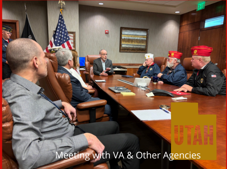
Meeting with VA & Other Agencies