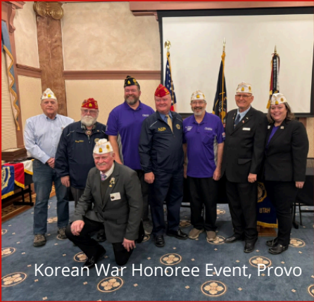
Korean War Honoree Event, Provo