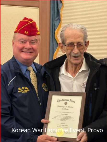
Korean War Honoree Event, Provo